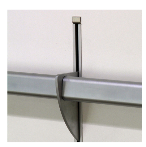
code: 2035AN inset4 upright - anodised natural